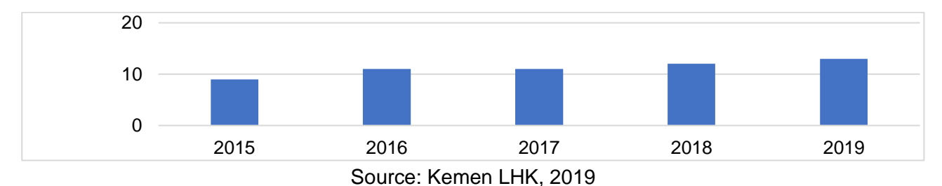
Figure 1. The total Companies that disclose CED Registered in PROPER

Environmental contamination by industry is one of the major problems that has gotten a lot of attention. Water contamination from toxic waste, flooding, landslides, species destruction, decreased soil productivity, disrupted environmental balance, and ozone layer perforation are only a few of the issues that occur. As a result, a company's obligation extends beyond generating income for investors to include not only management and capital owners, but also workers, customers, society, and the environment. Corporate Social Responsibility refers to a company's environmental responsibilities (Abidin and Lestari, 2019).